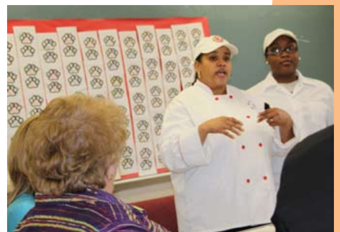
Popular career track—Restaurant Management (ProStart)