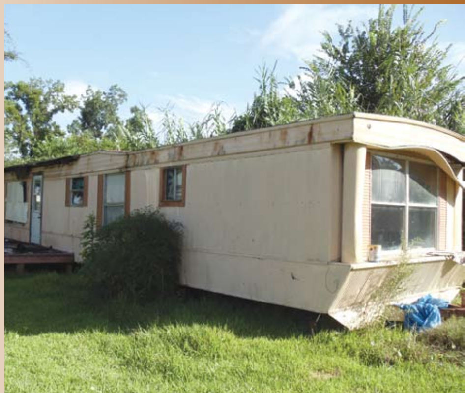
Shown is a dilapidated trailer that will be removed as part of Rosedale's $528,000 housing rehabilitation project.