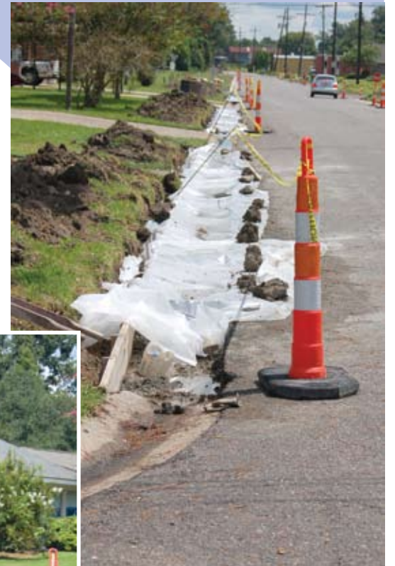
Shown are scenes from work to replace curbing on streets. A total of 20,000 linear feet of curbing will be replaced as part of the city's road improvement project.

Phase II includes sewer repairs, and more asphalt and concrete road resurfacing. City officials approved the sewer portion of the contract at their July 27 meeting, and the sewer work began by September. The asphalt portion of Phase II will be bid out in October.