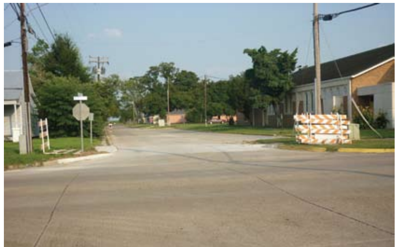
Shown is the corner of Church Street and Bowie Street (next to Our Lady of Prompt Succor Catholic Church) after completion of resurfacing. The street was the first to be completed during the Road Improvement Program as it was damaged due to extreme heat last year.

The town is also purchasing generators for the police and fire departments as well as the community center, which will be paid for with the Iberville parish and LRA Gustav/Ike funds. In addition, the town will be replacing major equipment in the sewage plant, resurfacing the downtown streets, and adding street lights.