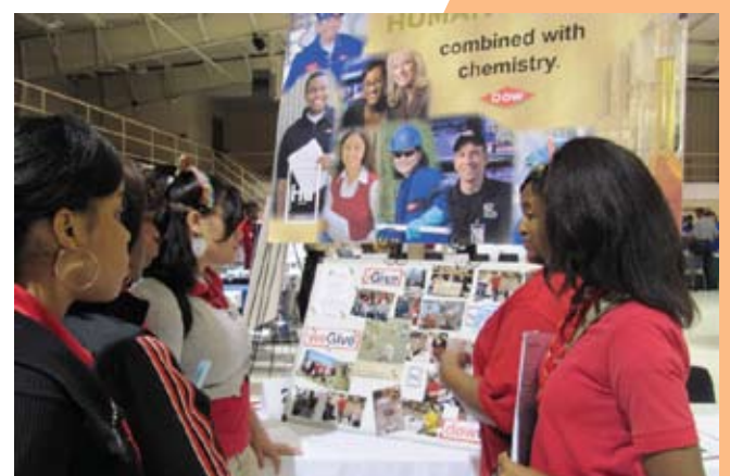
Job fair for high school students