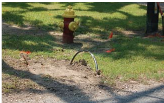
The line and tap-in markers at homes along the route of a new 6-inch water line.