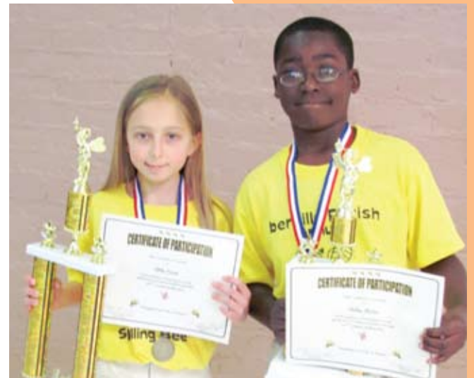
Spelling Bee builds literacy skills