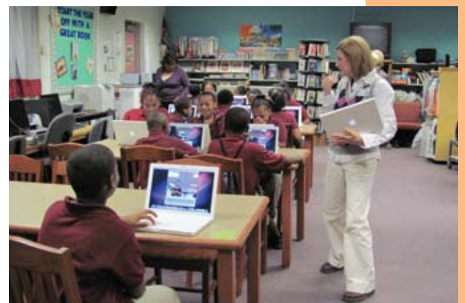
"Our students must have computers to compete"